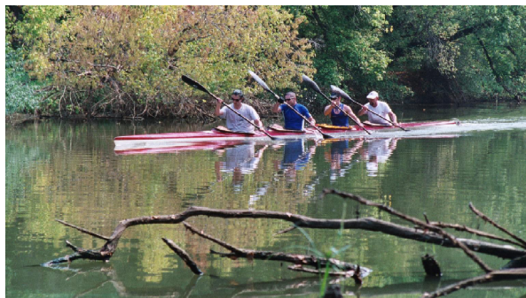
A kayak race on the Elm Fork.

The thousands of acres that comprise the Trinity watershed as it passes through Fort Worth and Dallas constitute a potential environmental treasure virtually unparalleled in urban America. Comparable environments are such places as the 70 mile long Golden Gate National Recreational Area near San Francisco, and the 20,000 acre Metropolitan District Commission Reservations in eastern Massachusetts. This is the scale at which the entire Trinity enterprise should be considered, with the area encompassed by this plan serving as its heart. By comparison, Denver's South Platte River Park (see next page), as impressive as it is becoming, constitutes less than half of the acreage of the Trinity floodway.